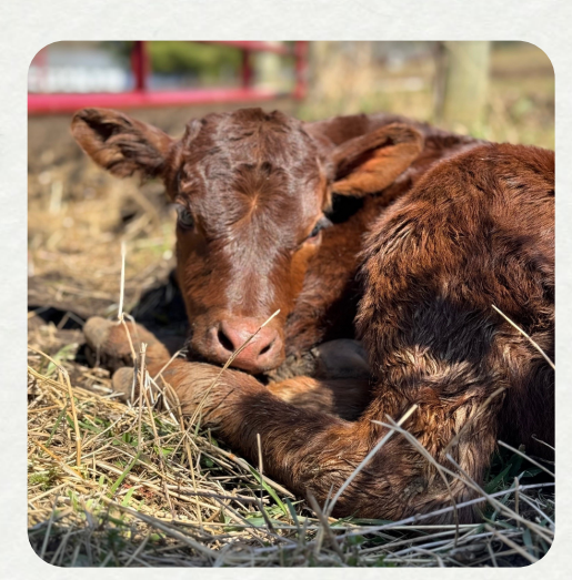
Town Hall's newest neighbor! Baby Calf born - 36 Pine Street

Roads in the northeast part of town will be resurfaced in the last part of April. This includes Lake Road, Town Street, and roads in Cornwall Hollow. We use stone instead of sand seal because it lasts longer and creates less dust.