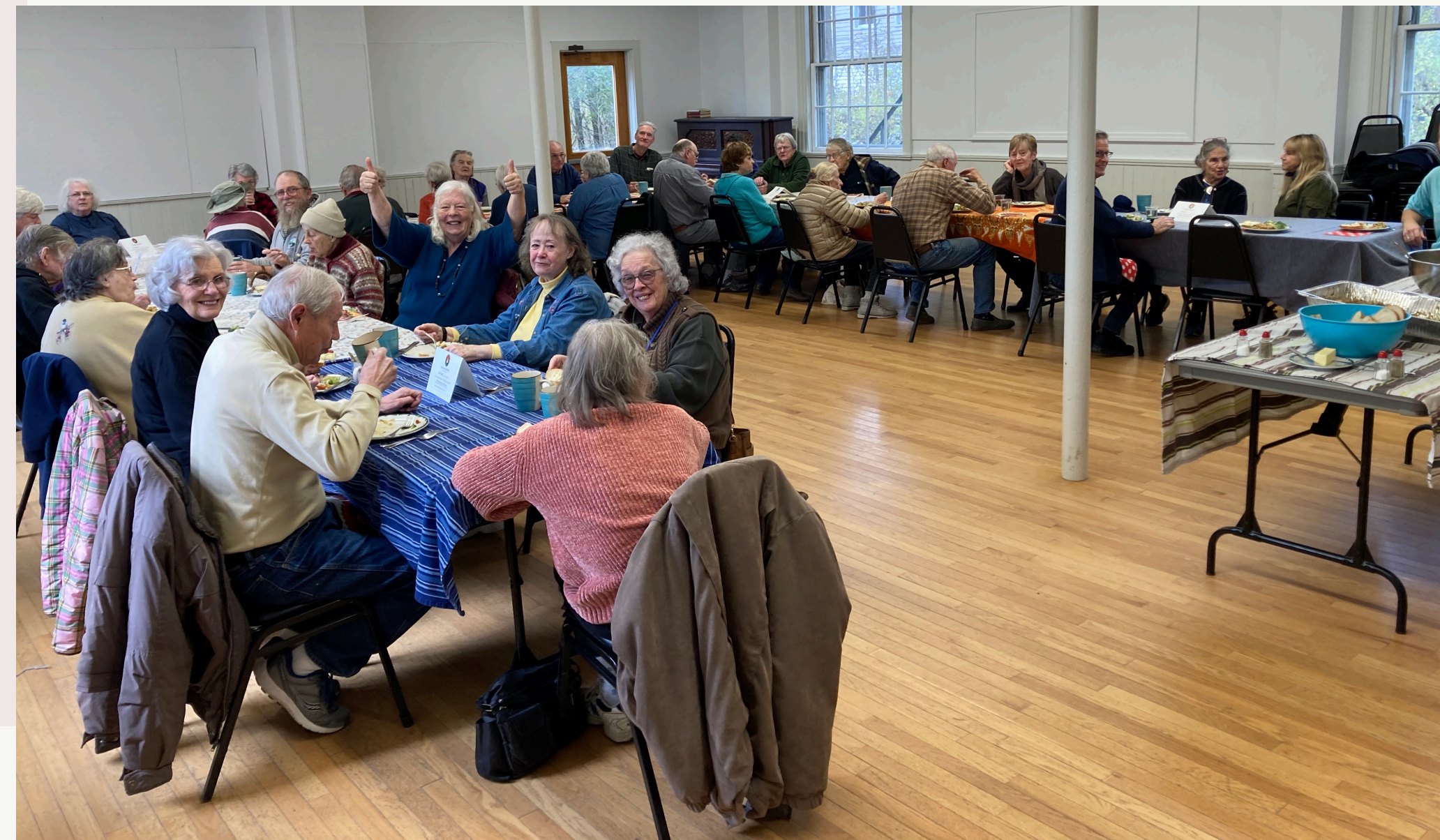
Bottom Nov 2023