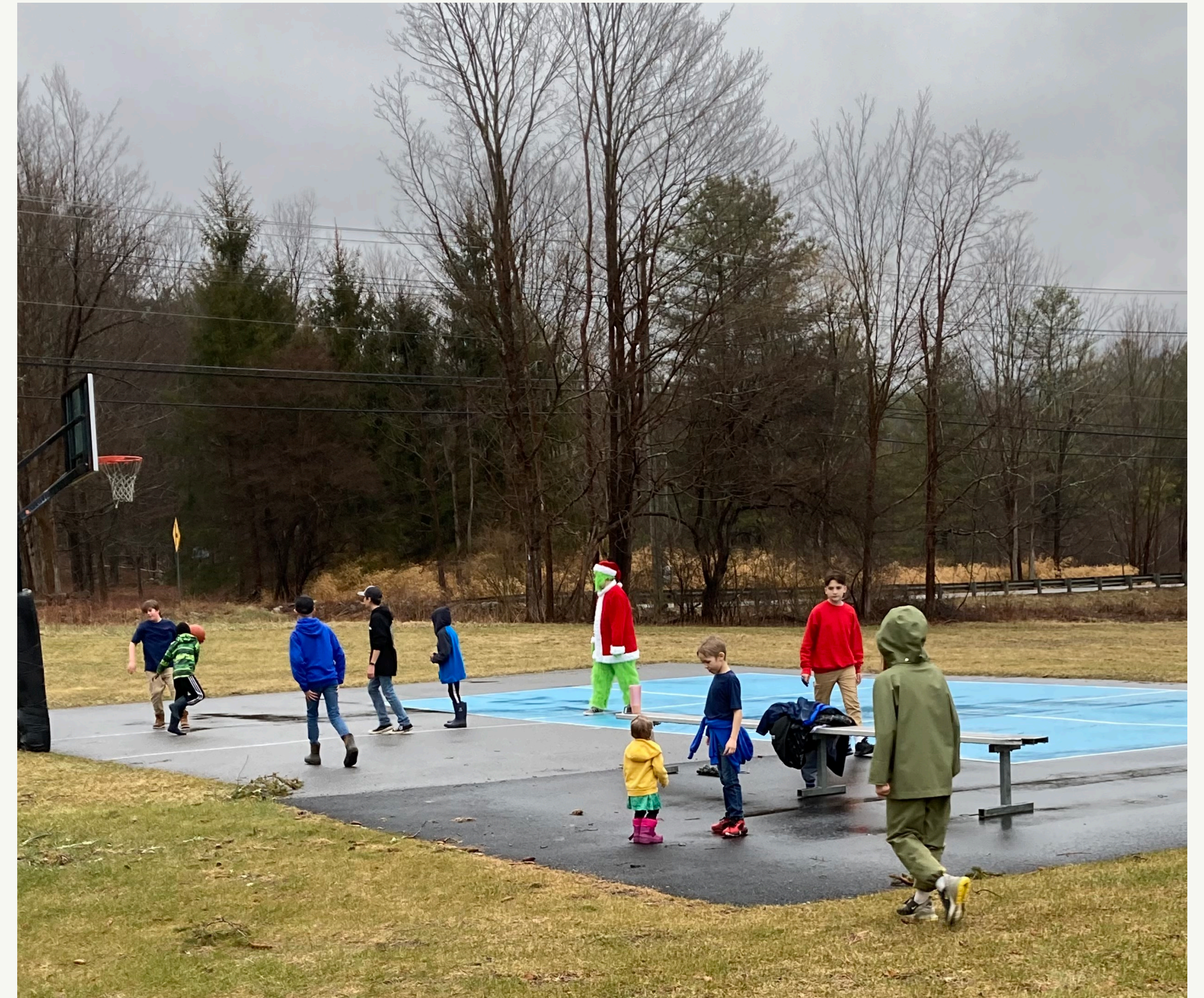
The Pickleball and Basketball courts share a space. Our April fools Spring Event had a fun pick up game of basketball.