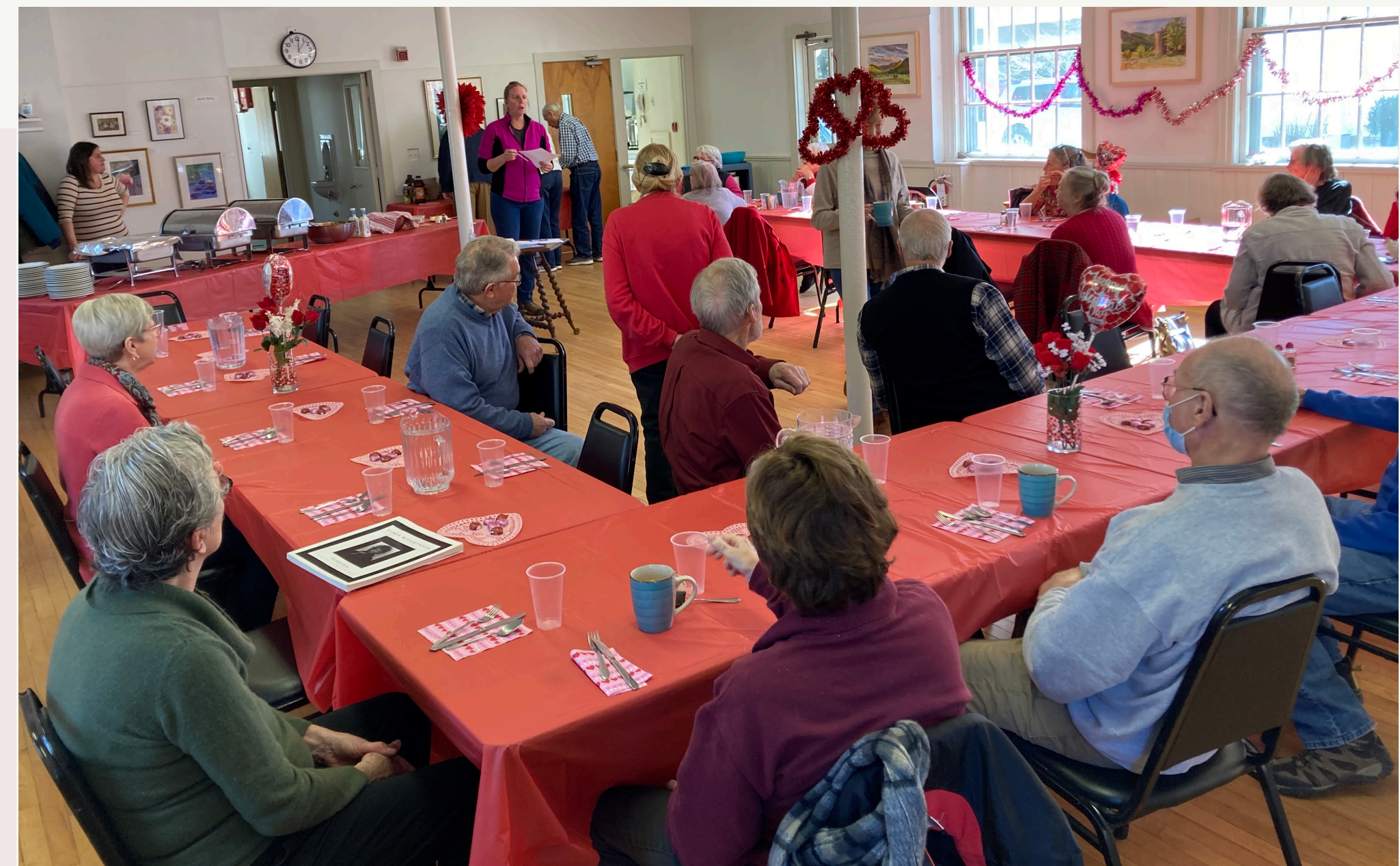
Community Lunch: Top Feb 2023