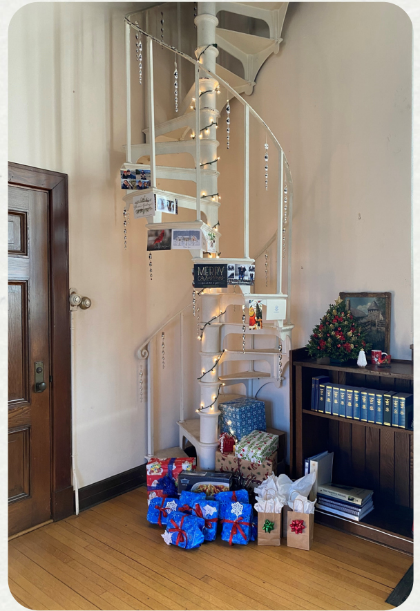
Cornwall Town Hall "Christmas Tree"